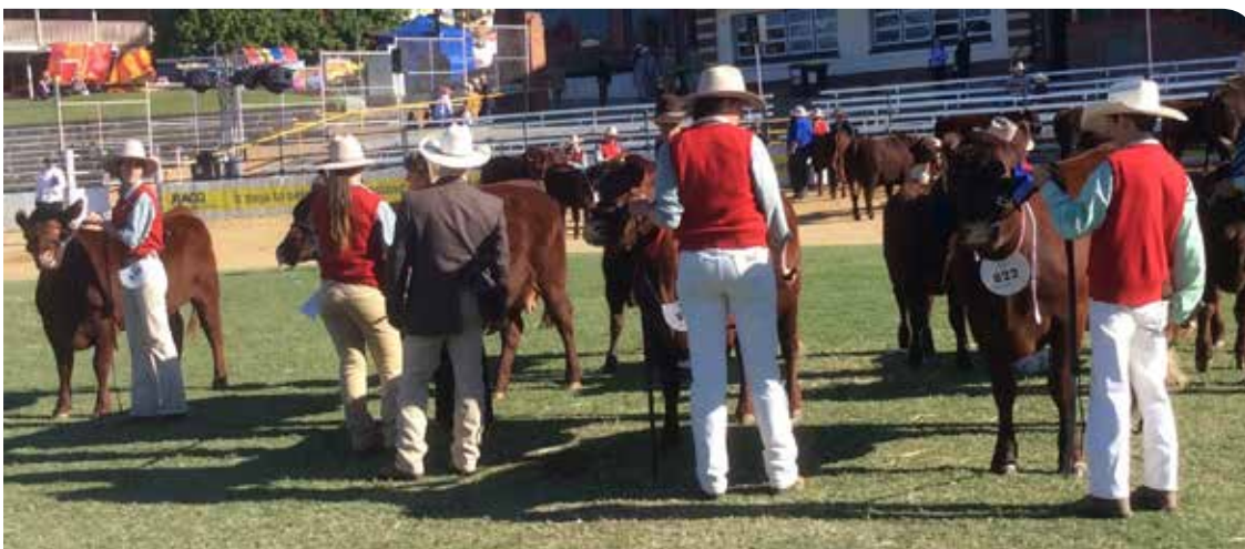
Showing at the EKKA